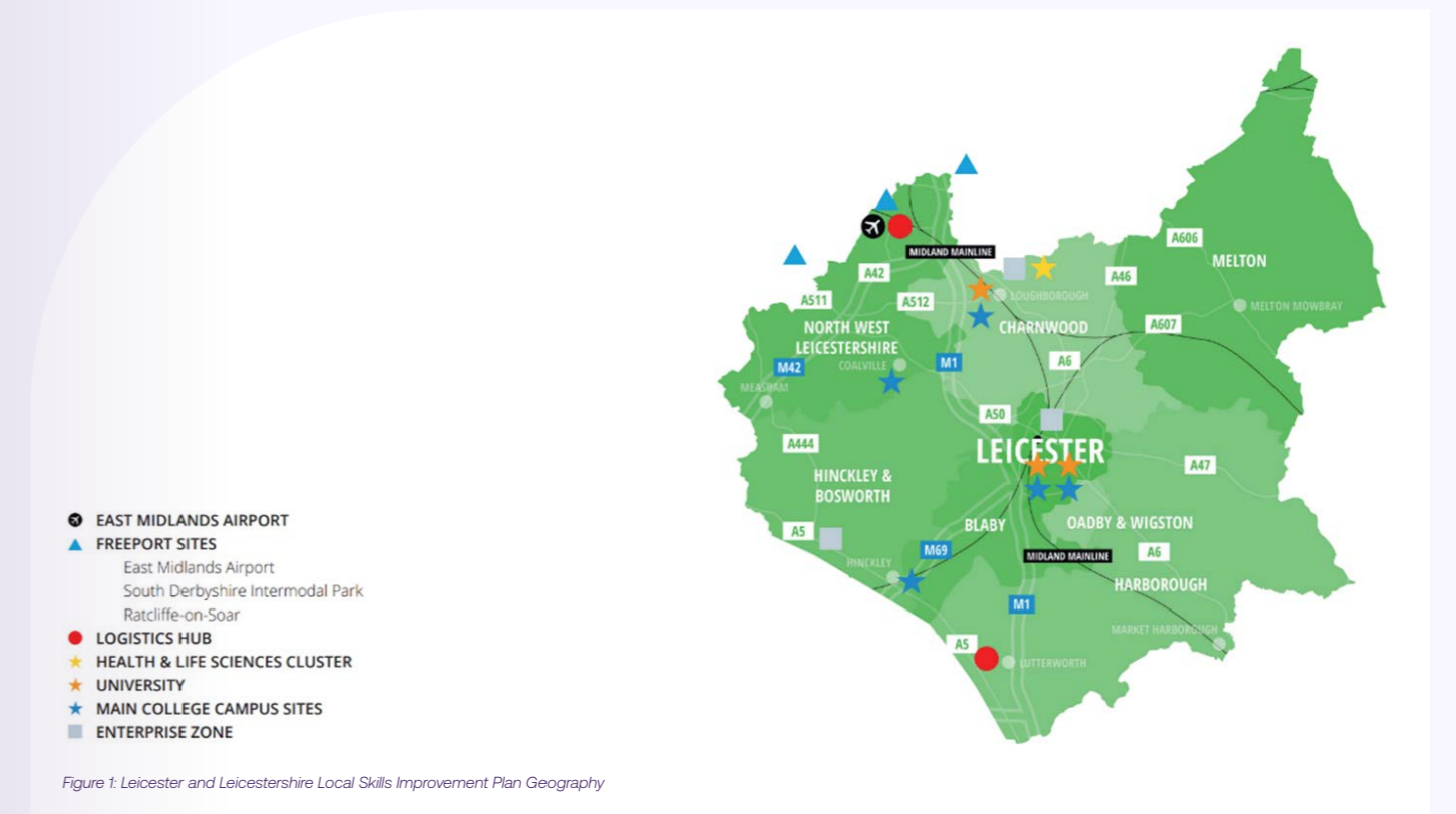
Figure 1 details the key sites within the LSIP geography pertinent to this Plan.

1.08 million people live in the Leicester and Leicestershire, with a working age population of 684,000. There is great cultural diversity across the city, with Leicester recognised as being one of the most ethnically diverse cities in the country. At the end of 2022 there was an economic inactivity rate of 22.1%, compared to a national level of 21.6%. 15.5% of households were deemed workless compared to 14% nationally. As of February 2023, the area had an unemployment rate of 3.2%, lower than the national level of 3.7%, although these figures mask significant variations across the different districts, boroughs and wards, with the highest levels of worklessness and unemployment found in wards within the City.