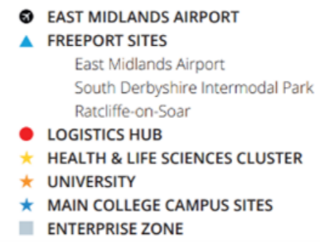
Figure 1: Leicester and Leicestershire Local Skills Improvement Plan Geography