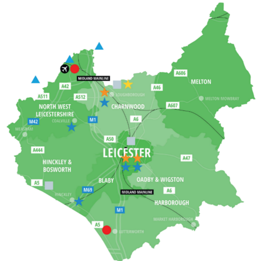
Figure 1 to the right details the LSIP geography and the key sites within it.

While this represents a significant change to local structures, the ultimate impact on delivery against the LSIP recommendations is negligible. While it is important that the work of the LSIP feeds into wider strategic decisions being taken locally, the LSIP's own governance arrangements are managed by East Midlands Chamber as the DfE-designated lead employer representative body and not impacted by any other changes.