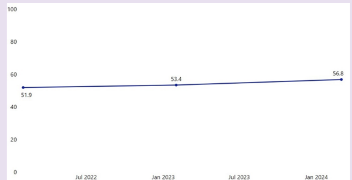
Chart 1: State of Local Skills Provision

Finally, through the survey work businesses have been asked the question: Are things better or worse now than 12 months ago, and given the option of better, worse or no change. Responses here demonstrate a significant improvement in net score (those who feel things have improved minus those who feel things have worsened) from 7.1% in February '23 to 20.2% in March '24.